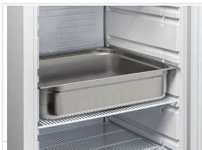
Cabinet suitable for GN2/1 pans