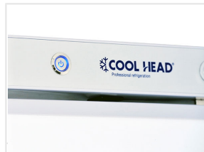
Blue backlit main switch