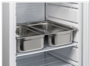
Cabinet suitable for N.2 GN1/1 pans