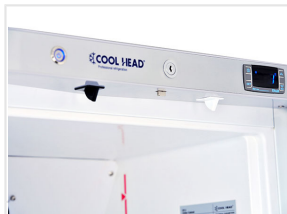
"Door opening and Hi/Low temperature alarm" as standard