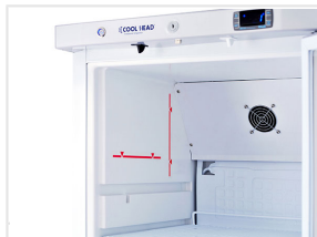
Air circulating fan assistance