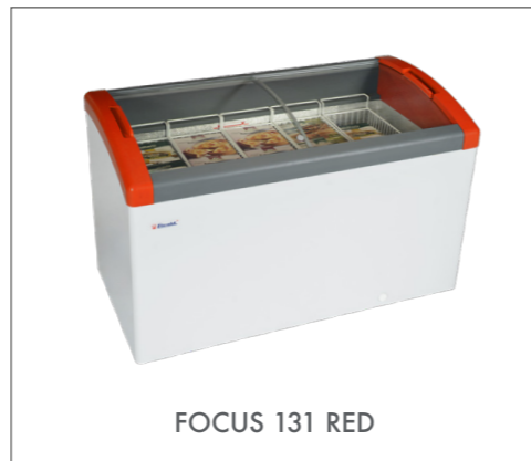
FOCUS 131 RED