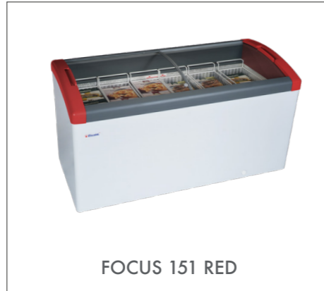
FOCUS 151 RED