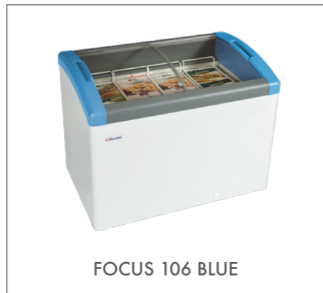
FOCUS 106 BLUE