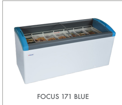
FOCUS 171 BLUE