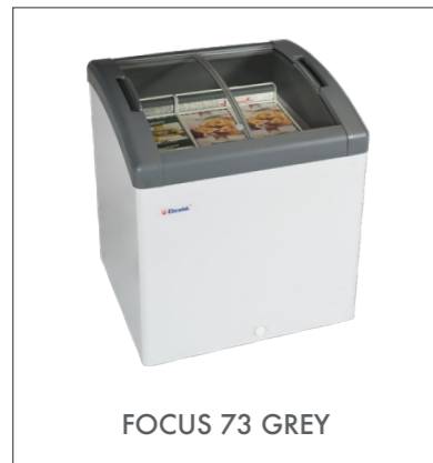
FOCUS 73 GREY